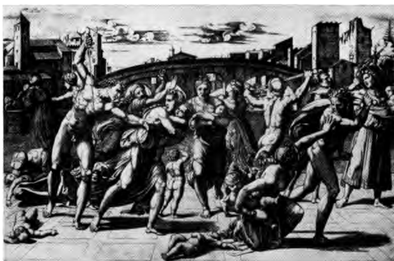
THE MASSACRE OF THE INNOCENTS BY MARC ANTONIO RAIMONDI

There are two versions of this subject. The present one (Bartsch 18) is distinguished from the other (Bartsch 20) by the presence of a little fir-tree in the upper right hand corner. Some critics have considered the one the original, some the other; the British Museum has reproduced Bartsch 18 as the original, and Lippmann B. 20.